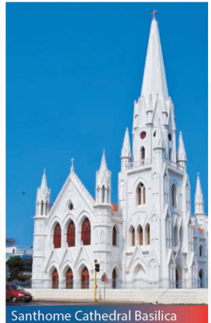
Santhome Cathedral Basilica