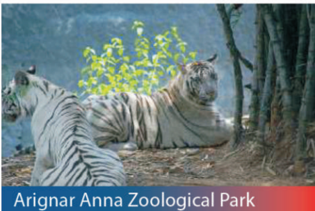
Arignar Anna Zoological Park